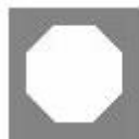
Type 9 7.5 x 7.5"